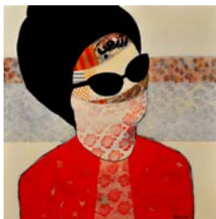
'Om Kalthoum' 180 X 180 cm. Acrylic on Canvas 2011

Resulting from a visceral sense of expression, these recent canvases are testimonies to the artist’s own reactions to the formidable events of the past year as the Arab world has been forced to entered a new phase in its modern history. In much of Hiary’s work, these changes are captured by outlines of the female body in the form of many incarnations: as a mother, as a young woman who sneaks away to meet her lover, as a screaming prisoner, as a muffled Egyptian songstress Oum Kalthoum. Sometimes appearing as fragmentations, these representations capture an uncertain reality in which women remain steadfast in the face of adversity. Acting as a metaphoric terrain upon which patterns and brushstrokes take on the psychic weight of an engulfing turmoil, Hiary utilizes the emotive quality of abstraction to summarize the everyday impact of these recent times.