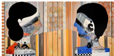
'Jabal Qasioon' 140 X 300 cm. Acrylic on Canvas 2011