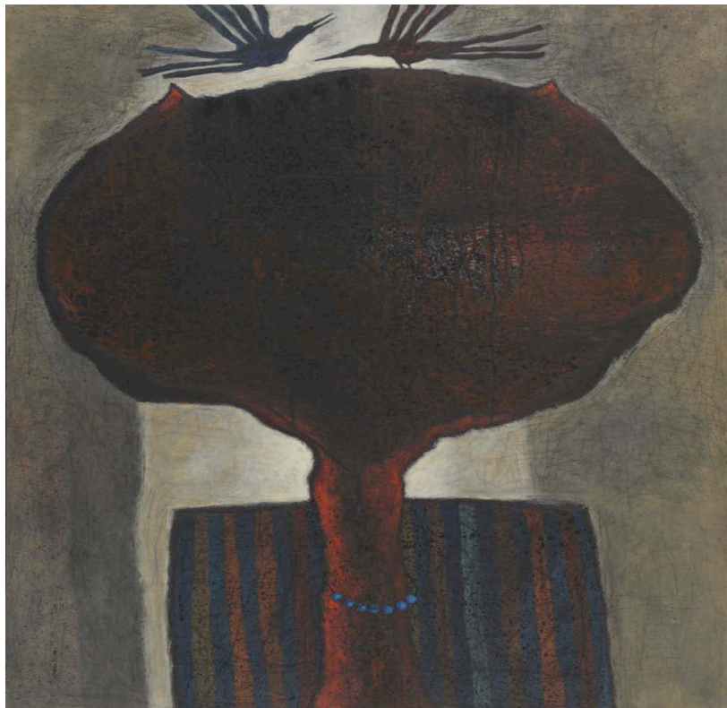
'Close' – 145x113cm – Mixed Media on Canvas - 2009

One of Al-Turk's greatest strengths is his use of colors. His works embody naïve flatness and the lines he draws always emerge tormented. Even the simple bowl of fruit that has frequently appeared across the ages of still life seems to scream out in distress.